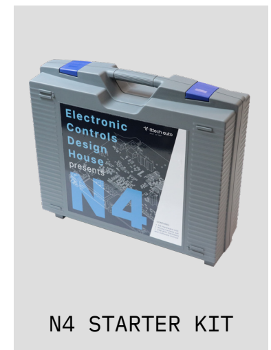
N4 STARTER KIT